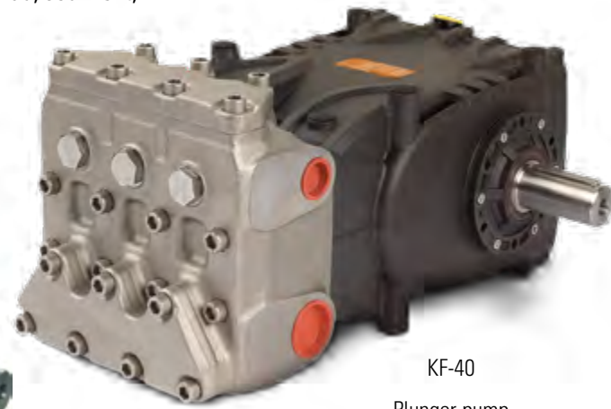
KF-40 Plunger pump