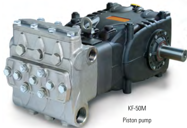
KF-50M Piston pump

The ELEPUMP KF pump series is well known for its performance and easy maintenance, but is mostly selected for its outstanding durability. The KF-30 and KF-40 plunger pump model is best suited for clean water while the KT-45 and KF-50M piston pump model will perform best when there is mud, sediment, bentonite or cement in the water.